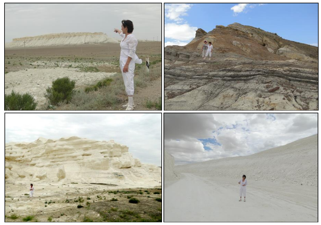
Figure 4. Mountain Mangyshlak Geomorphosites

Manayshlak Mountain is represented by low ranges of the North and South Aktau. Western and Eastern Karatau. The Karatau ridges are composed of dislocated mudstones, schists, Permo-Triassic limestones and conglomerates represented by large ridges with leveled or slightly wavy peaks and steep, sharply dissected slopes (Bekzhanov et al., 2000). The ranges are facing the Karatau valleys and rise above them by 100-200 m. The highest point of the town of Beshoky is 556 m, in East Karatau, Deposits of greenish clays at the foot merge with vellowish, pink, reddish clays or snow-white chalky outcrops; above they turn into yellowish-brown Sarmatian limestones. All of this is represented by a unique, layered formation, because the strata of deposits of unequal density and are susceptible to erosion in different ways (in particular, the layering of rocks is clearly visible on the coast). In Northern Aktau there is a unique place called "Akespe" (Figure 4). It is also called the "chess valley" because of the location of the rocks. The area is distinguished by a peculiar whiteness due to stacked rocks: limestones, marls and snow-white clays. Due to wind erosion, a typical type of relief has formed here, giving the area a beautiful landscape. The peaks of low snow-white mountains are cut by ravines and hollows. In the spring, during rain, stormy streams run along them, sometimes demolishing roads and settlements.