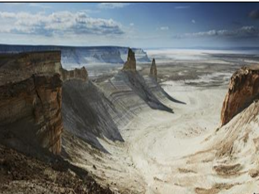
Figure 7. Boszhira Geomorphosite

Outlier mountains-chameleons also formed here, changing their appearance depending on the position of the sun and the time of day, a mountain-yurt, rocky gorges with steep walls, eroded chalk strata, stone nodules. At the bottom of the hollow you can find petrified shells and teeth of ancient sharks. A feature of Boszhira are two limestone peaks, about 300 meters (287 m) high, nicknamed for their form the "Azu Tister", translated from the Kazakh "Fangs of Ustirt". The peaks are cut by small ravines and beams, between which there is a narrow path along which you can climb to the observation deck from which a wide view of the Boszhira valley opens.