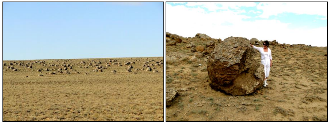
Figure 3. Torysh Geomorphosite

Shetpe to the north-west. In morphological terms, the table remains with a complex gully-relief relief. Mount Sherkala is a lonely standing mountain, of a very unusual shape. If you look at it from one side, the mountain looks like a huge white vurt