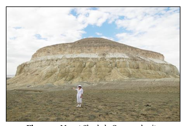
Figure 2. Mount Sherkala Geomorphosite

Mount Sherkala Geomorphosite. The territory of the geotope Mount Sherkala is located about 170 kilometers from the city of Aktau, 18 km from the village (Figure 2).