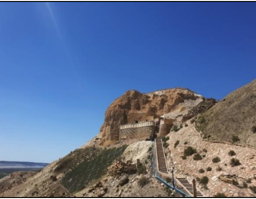
Figure 6. Ustirt chinks and the Becket Ata necropolis