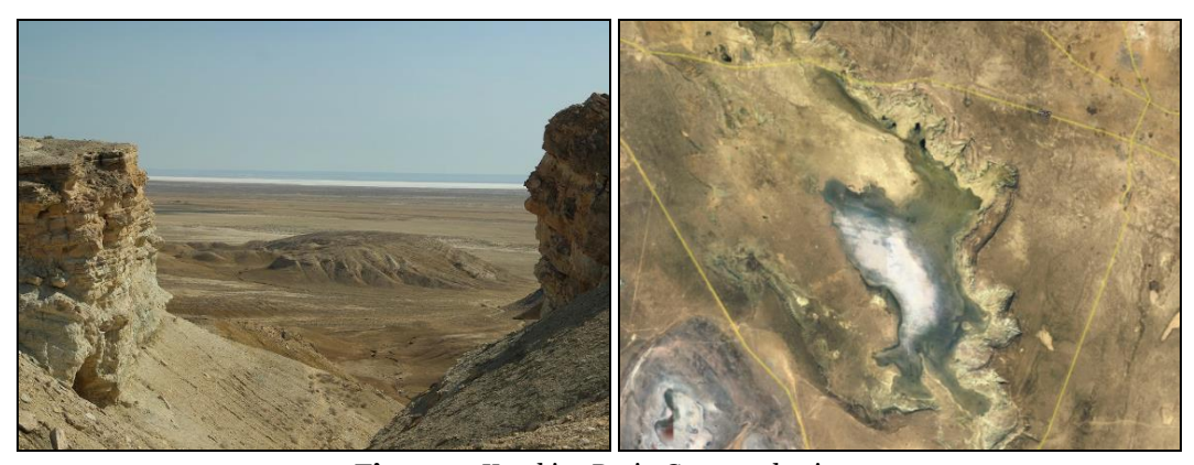
Figure 5. Karakiya Basin Geomorphosite

of this part is covered mainly with sand. Litter is located at the bottom of the cavity, the descent to which is hampered by deep steep and winding ravines. The Eastern slope of the basin is high and cut through by deep ravines. According to local tradition, a long time ago there was a lake on this place, which was called "Batyr" - "Brave Warrior". The lake gradually dried up and a hollow formed. Locals still call basin as the "Batyr" basin. The formation of a basin is associated with the leaching of salty rocks, with subsidence and karst processes (Aristarkhova, 1970). The karst is based on the erosive and dissolving activities of groundwater. Underground water seeping to the bottom of the cracks found in limestone, dolomite and gypsum, gradually dissolved the rocks, expanded them, developed deep and narrow abysses (Kondybai, 2007).